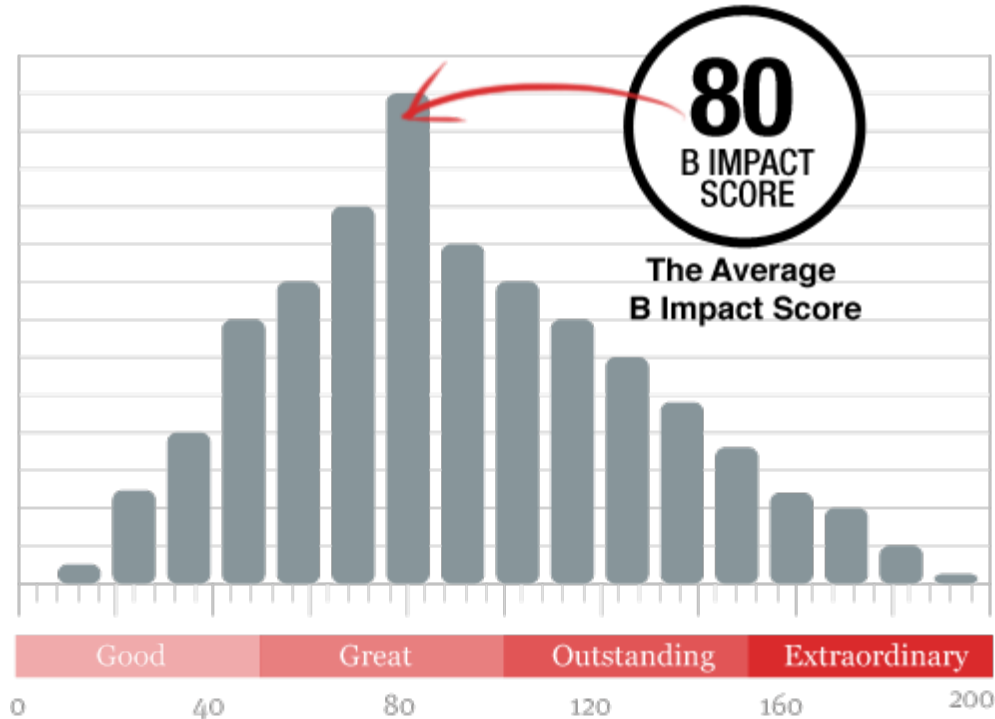
Figure 1. What is considered a "good" score?

available.” 1 Based on the B Impact Assessment website (see Figure 1), our score of 134 puts us in the “outstanding” cohort of companies.